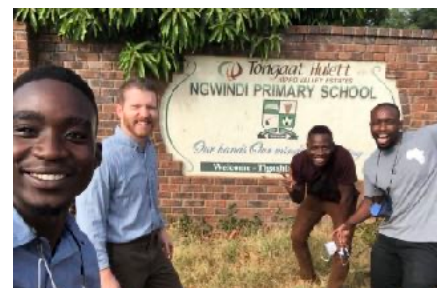
With lockdown over, we are back touring schools