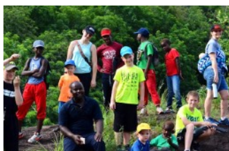
Lawson & Chida families in the rural areas